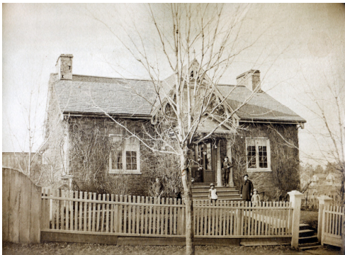
Hutchison House circa 1870s

For information on coming events please visit our website at www.hutchisonhouse.ca