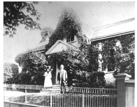
Hutchison House 1910