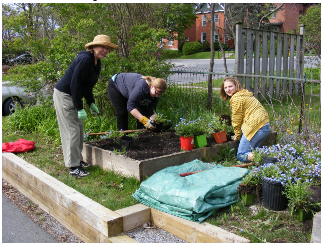
Dig Day May 5, 2012

We're anticipating a rousing success with our upcoming 175 th Anniversary Open House on June 3 rd and have several other plans under development for the fall. For more details of coming events please visit our website at www.hutchisonhouse.ca which will be updated on a regular basis throughout the summer.