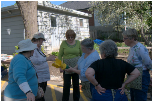
Pricing and identifying