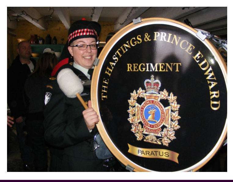
Hastings & Prince Edward Regiment drummer