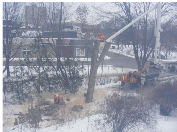
City crew removing Maple tree