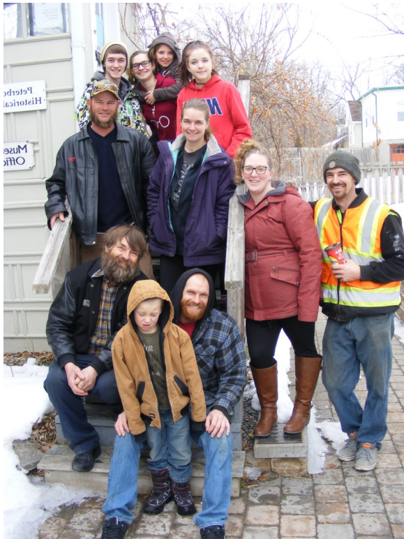
The Baker Clan