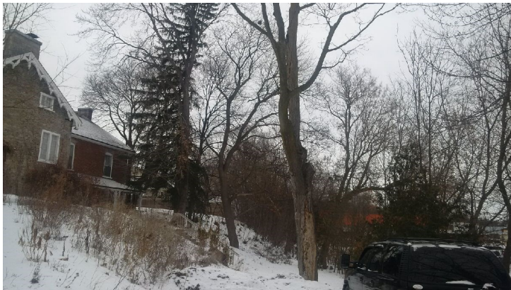
The dying Maple tree