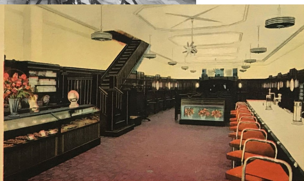
"THE ELITE". The Most Beautiful Restaurant and Tea Room in Canada, PETERBOROUGH, ONTARIO.

Postcards: "The Elite" Photogelatine Engraving Co. Ltd., Ottawa, 1936 Peterborough Museum & Archives