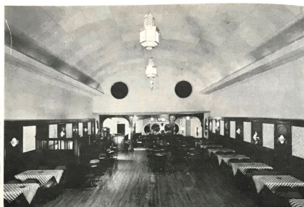
The Elite Court over the Elite Grill, one of Canada's Finest Restaurants

Now...When Congratulations are in Order... Let Us Extend Ours