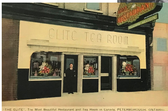
"THE ELITE". The Most Beautiful Restaurant and Tea Room in Canada, PETERBOROUGH, ONTARIO.

Elite Court looking east – bandstand in George Street window