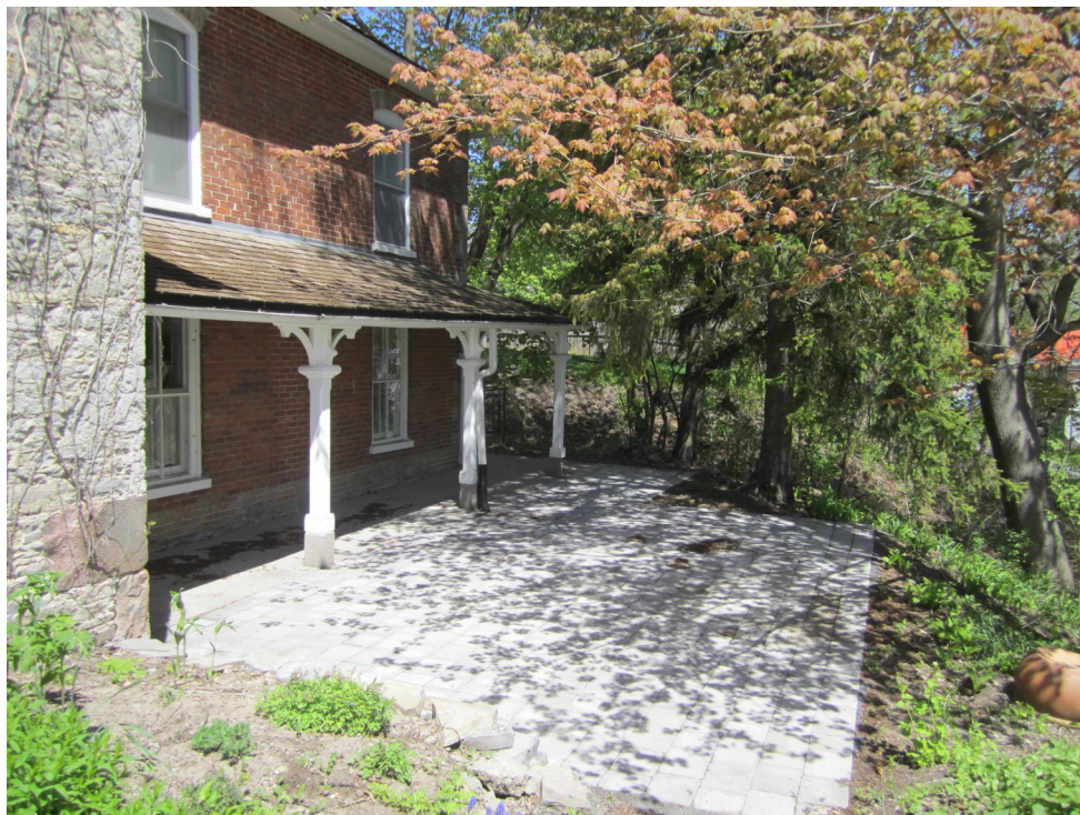
An inviting spring view of the new patio at Hutchison House

I wish to make a special donation to the Peterborough Historical Society to assist with the operation of Hutchison House in the challenging circumstance of the COVID-19 pandemic. Please allocate my donation as follows: