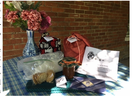
Scottish Tea in a bag

While we were unable to host day camps this summer, the museum has been offering three different Day Camp kits for use at home. The kits, available at $15 each or two for $25, include instructions and all the material needed to create one of our popular Day Camp projects: Bookbinding, Teddy Bears and Fairies. For added instructions, our summer students created video tutorials available on our YouTube channel. With a boost from a CBC radio interview with Wei Chen on Ontario Morning, the first Day Camp kits were sold out on day one!