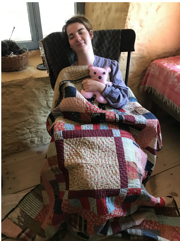
Halsea and a Day Camp Bear