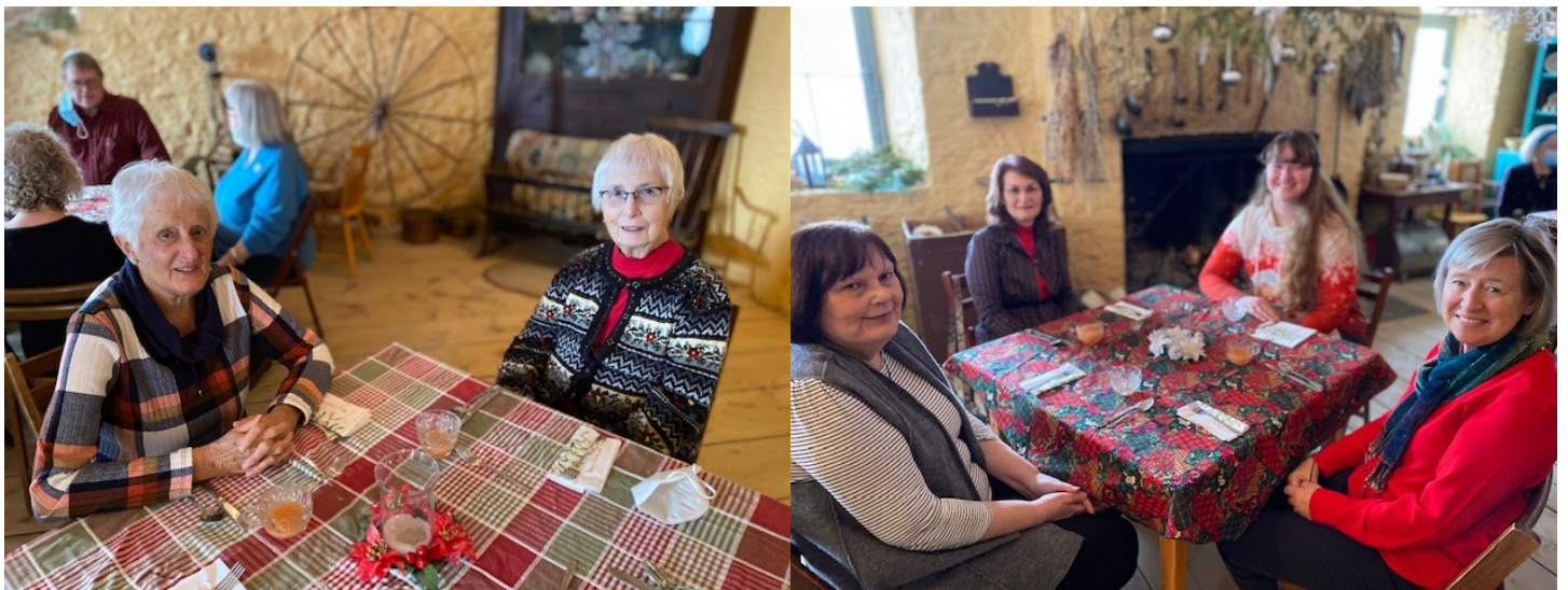
Hutchison House Museum Volunteer Christmas Pot Luck December 22,2022

The next event for the museum will be the Heritage Luncheon on February 1 st . For more information or to register, contact the museum at info@hutchisonhouse.ca or call the office at 705-743-9710.