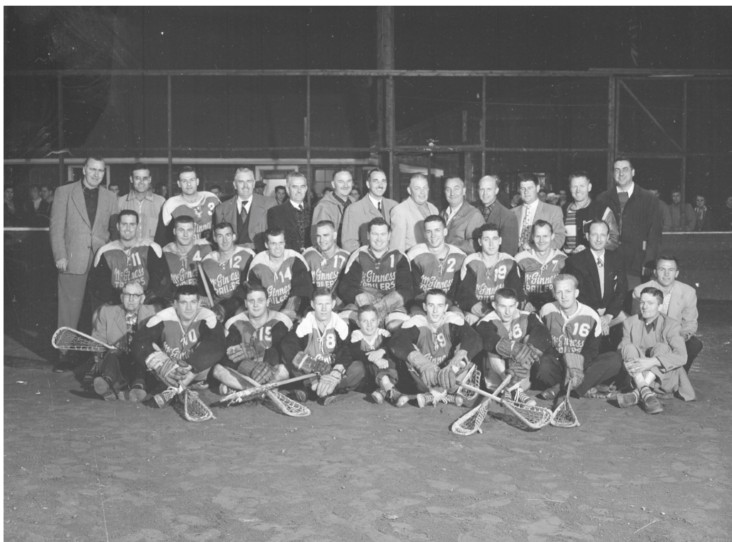
Peterborough Timberman lacrosse team, Mann Cup winners 1954, sponsored by McGinness Trailers