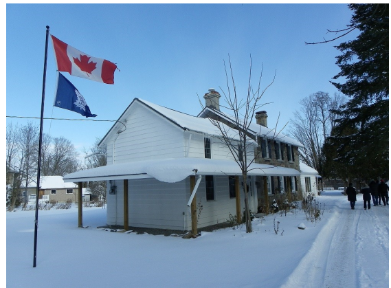
Old Stone Mill House, Lakefield