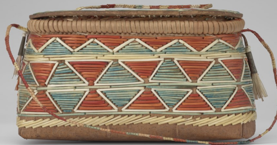
RCIN84306 Makak made by Polly Soper, 1860.

The exhibition is open and runs through November 2023. Further information can be found on the Peterborough Museum & Archives website under the Exhibitions and Events tab within the Featured Exhibition menu option. This information was kindly provided by Dustin McIlwain of the Peterborough Museum & Archives.