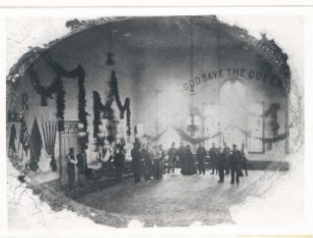
1860 Interior of Victoria Hall - Prince of Wales Visit

With its wall and ceiling paintings carefully restored, the 2nd floor Concert Hall today looks much as it did when the royal party danced there by gaslight in 1860. Twenty years later it was converted to a theatre and then in 1899 became a grand opera house with red plush seats, elaborate balconies, and boxes for the town’s elite.