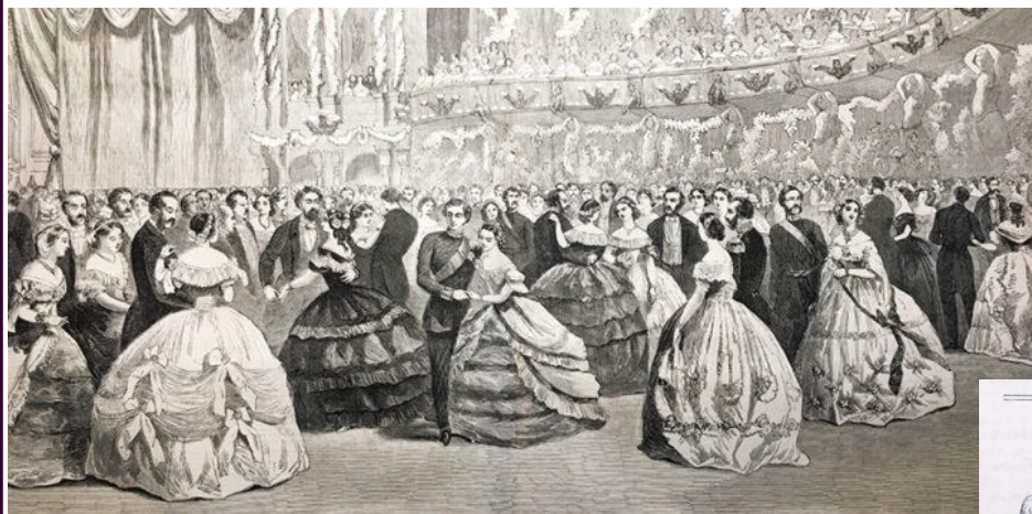
Harpers Weekly illustration Prince of Wales 1860 tour taken from Hathi Trust collection in the Public Domain