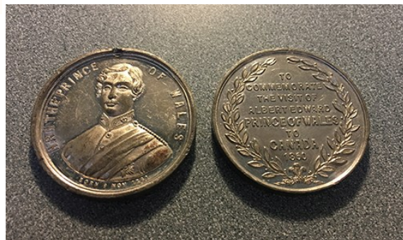
Commemorative Coin of the Prince of Wales 1860 visit to Canada.

Victoria Hall Concert Hall 1860 in Town of Cobourg Jubilee Walking Tour