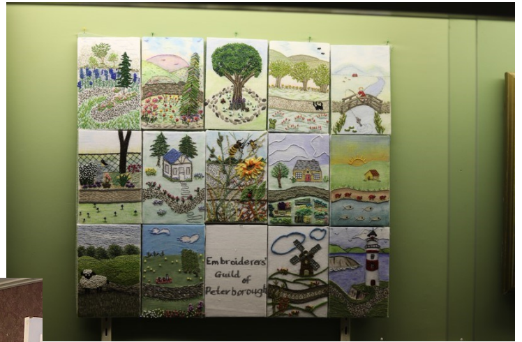
Peterborough Embroiders Guild "A Stitch Through Time"