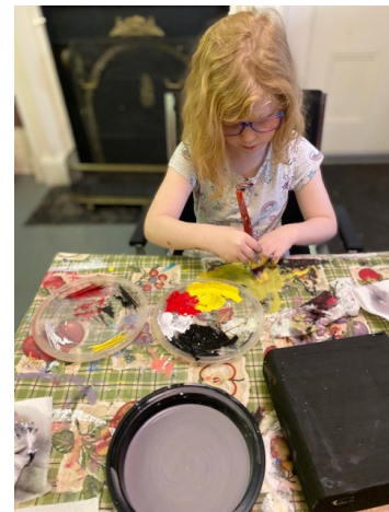
PA Day at Hutchison House Museum September 29 Rose