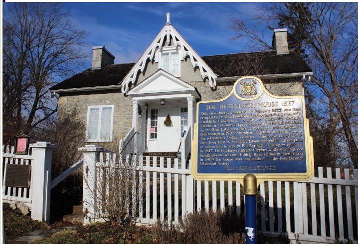
Hutchison House Museum Hogmanay 2019

Robbie Burns Day pick-up take-home meals Thursday 25 January