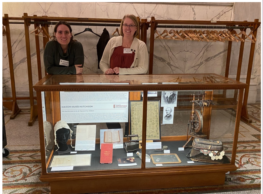
Exhibit at Queen's Park

For more information on these and other events, please visit us online at www.phs-hutchisonhouse.ca or contact the museum office.