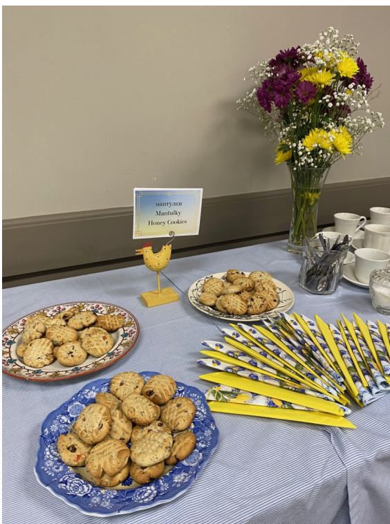
Ukrainian Honey cookies