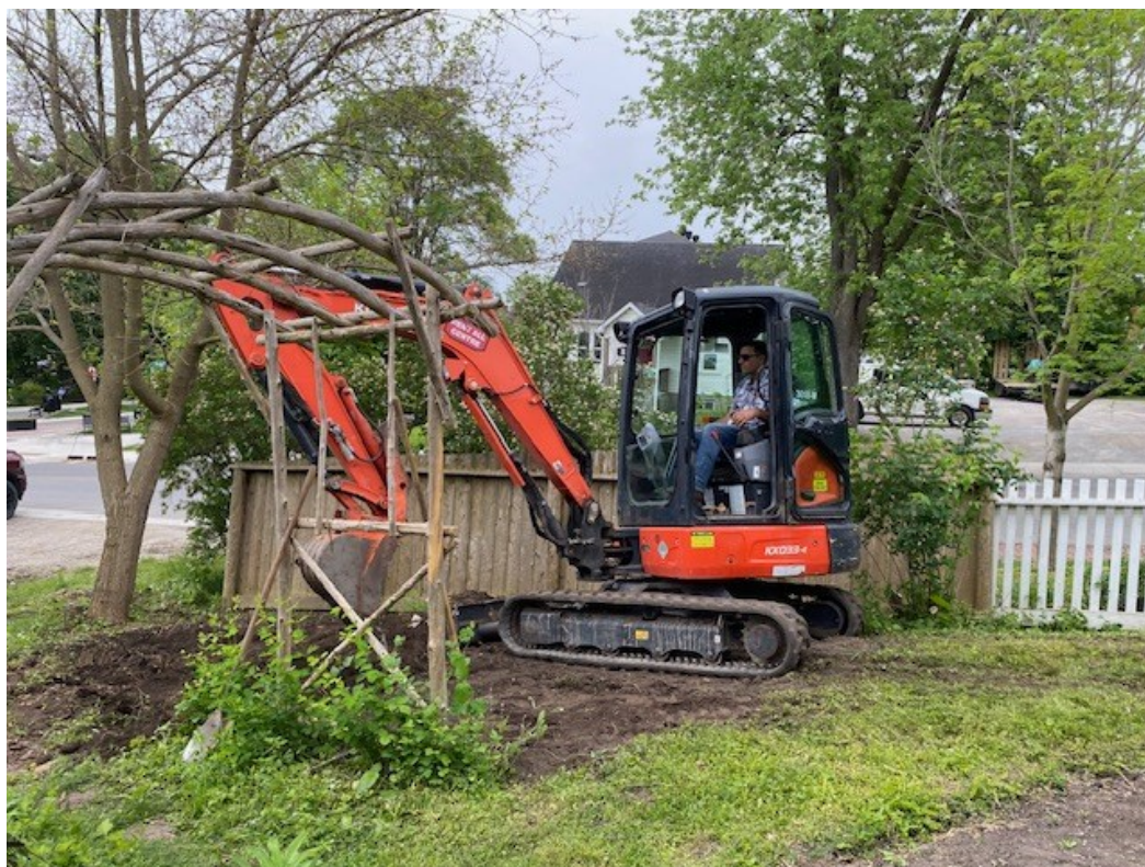
Rob Panepinto digging out the buckthorn roots at Hutchison House Museum