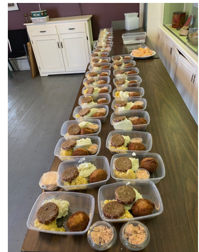
Robbie Burns take out meals ready to go