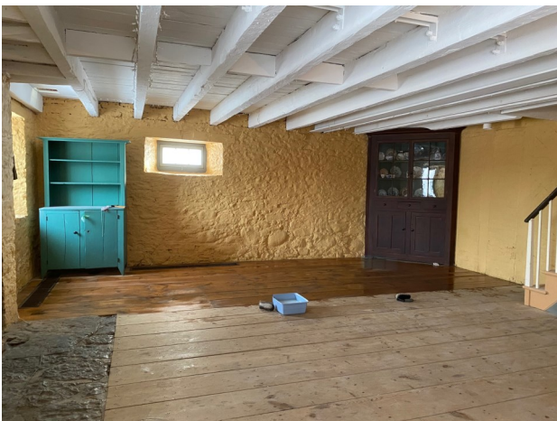
Cleaning Keeping room floor - notice the newly painted ceiling

If not, renew directly online at https://phs-hutchisonhouse.ca/support/become-a-member/new-and-returning-members/ , or download and complete the PDF form and mail it with your payment. Don't miss receiving the Bulletin , this year's Occasional Paper, and all the other benefits of PHS membership!