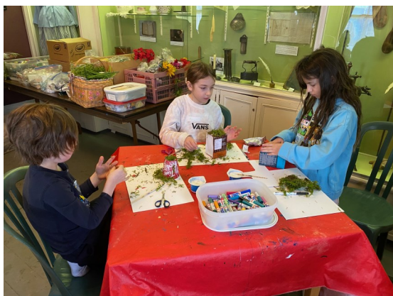
Building fairy gardens at PA Day Camp January 31, 2025

Experience a taste of Ireland from the comfort of your own home with a delicious St. Patrick's Day take-home meal. Enjoy corned beef and colcannon with roasted carrots and Irish soda bread, followed by a scrumptious Irish apple cake with custard for dessert. Meals are $30 each. Pre-order your meal by Monday, March 10 th at 5pm. Meals will be able for curbside pick-up between 12:00 noon and 4:00 p.m. on Friday, March 14th. For more information or to place your order, please contact the museum at 705-743-9710 or email info@hutchisonhouse.ca .