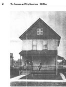
304 Maitland Ave circa 1912