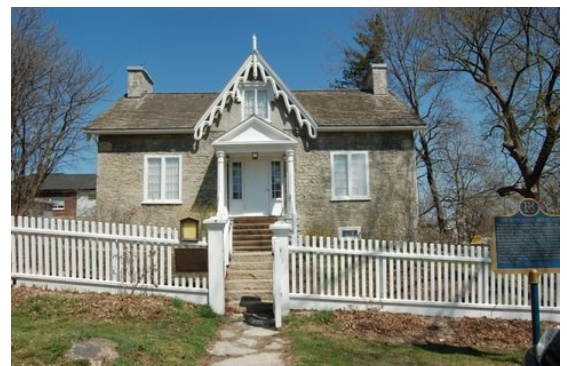
Hutchison House Museum